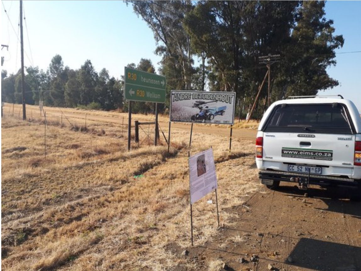
Site Notice 1

Site Notice: 19/07/2018 11:19:48; GPS Coordinates: -28.057220, 26.696670