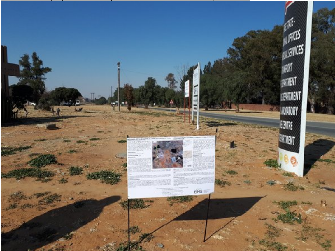
Site Notice 2

Site Notice: 19/07/2018 11:22:04; GPS Coordinates: -27.981940, 26.788610