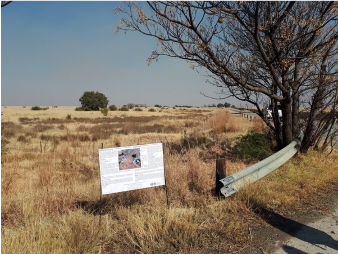
Site Notice 3

Site Notice: 19/07/2018 11:34:44; GPS Coordinates: -27.973611, 26.688611