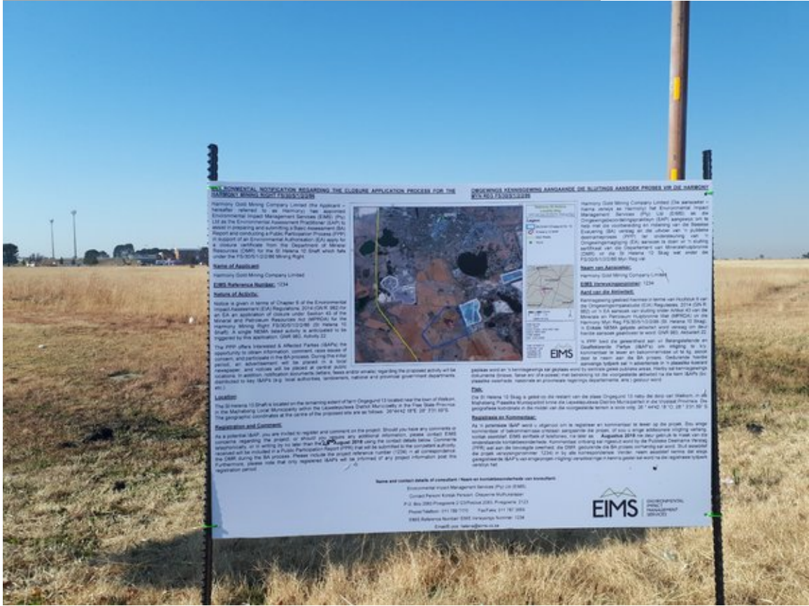
Site Notice 4

Site Notice: 19/07/2018 11:34:44; GPS Coordinates: -27.973611, 26.688611