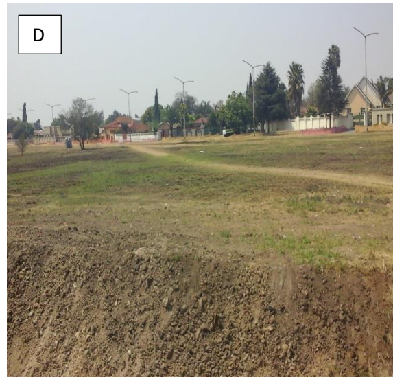
Figure 6: A. Surroundings of the wetland; B. Litter around the bridge; C. Rubble & building material dumped; D. Walking tracks.