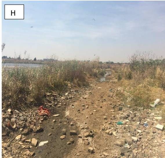
Figure 2: G. Soil mounds; H. Rubble around the wetland