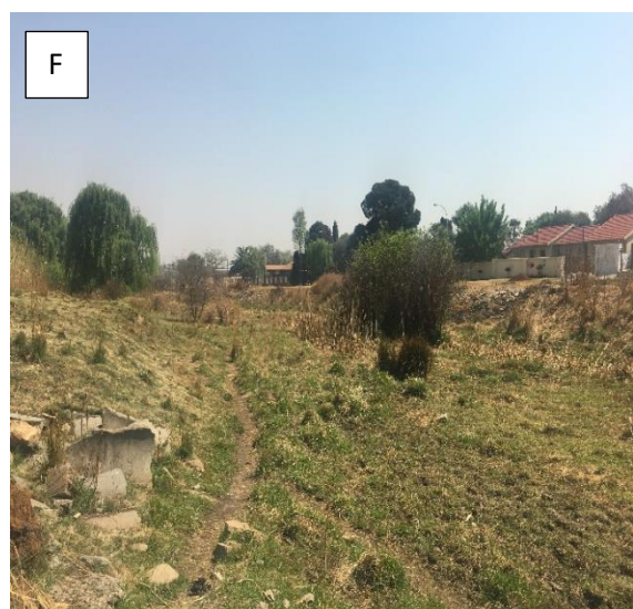
Figure 5: A. Erosion; B. Surroundings of the Wetland area; C. Livestock around the wetland; D. Rubble & building materials dumped in watercourse; E. Dysfunctional stormwater infrastructure; F. Walking tracks.