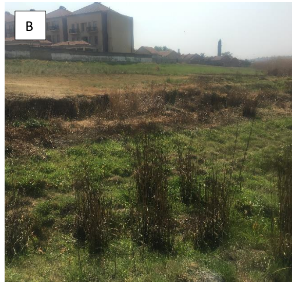
Figure 7: A. Scenery around the wetland; B. Erosion