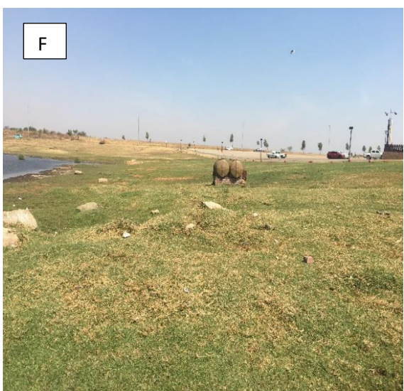
Figure 3: A. Pan; B. Walking tracks along the wetland; C. Erosion; D. Litter in eroded areas; E. Sand & building material; F. Water tanks for storing water