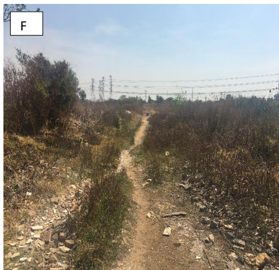
Figure 1: A. Scenery around the wetland; B. Polluted water & dumped material; C. Litter; D. Blocked stormwater infrastructure; E. Erosion; F. Tracks or walkways