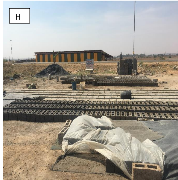
Figure 4: G. Car wash; H. Brick making facility